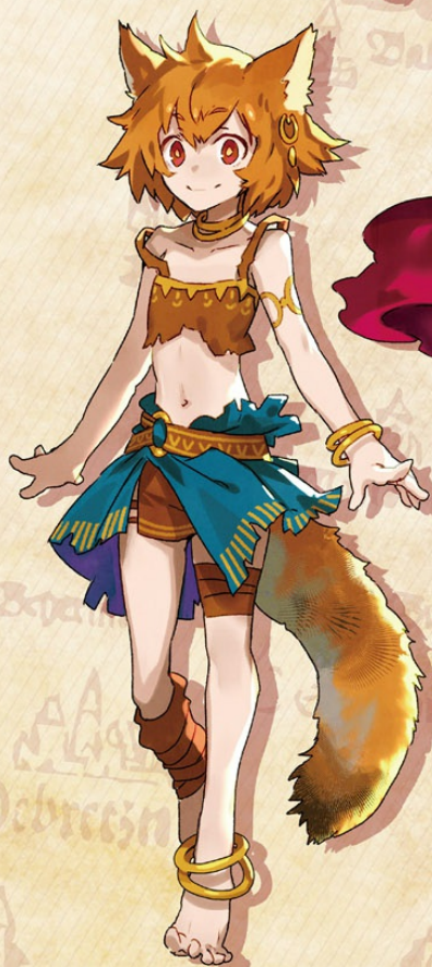
Beast General Lili